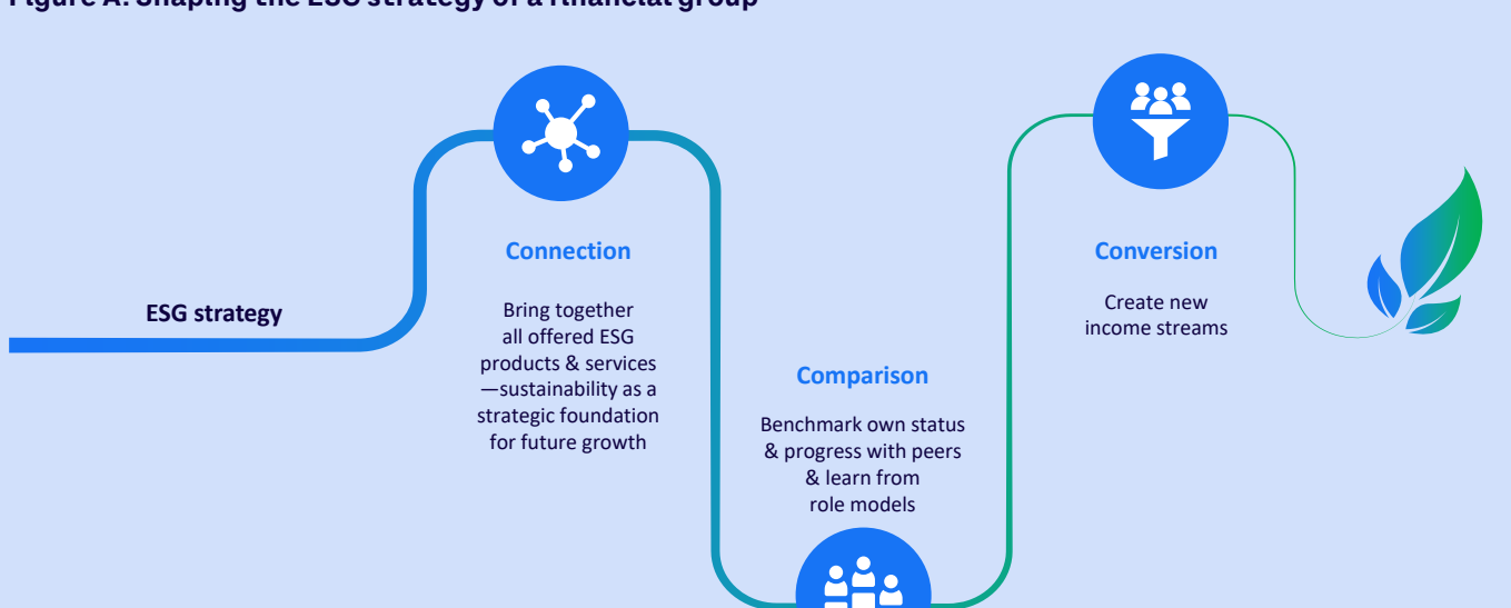
Figure A. Shaping the ESG strategy of a financial group

As a further step, financial institutions can go beyond an internal portal to providing a platform that is open to clients and through which nonbanking ESG products and services, provided by different providers, are offered. Expanding the portal to a wider ecosystem (e.g., including providers of renewable technology) increases commission opportunities and creates openings to offer tailored loans to aid purchases. This allows banks to be the primary ESG destination for clients, helping them take a leading role in the green transition.